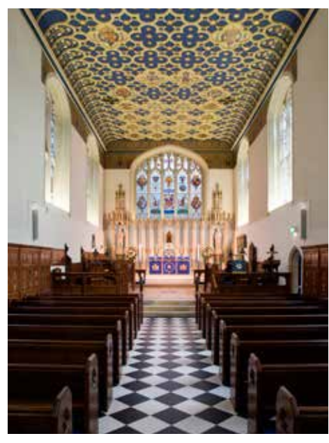
The Queen's Chapel of the Savoy

We are bidden to be faithful and obedient, flowing out and engaging with the community and expressing, as best we can, God's love. We are to proclaim the Good News and to be persistent in prayer, always ending with the perfect prayer, Thy will be done . It is important