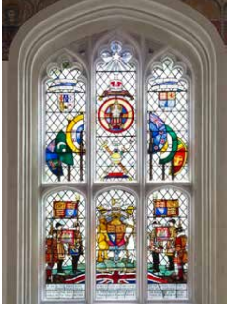
King George VI memorial window, The Queen's Chapel of the Savoy