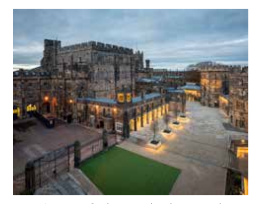
Lancaster Castle restored and re-opened

Following a two-year conservation and restoration project, the Duchy has now re-opened Lancaster Castle to the visiting public. The restoration works have revealed more of the Castle's historic buildings and opened up a cloister walk and open courtyard which have remained neglected and unused for over 50 years.