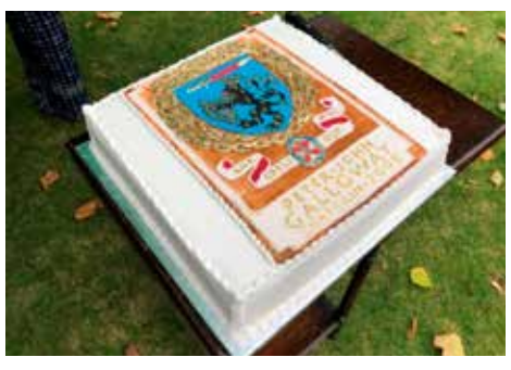
A cake was specially commissioned to mark the occasion