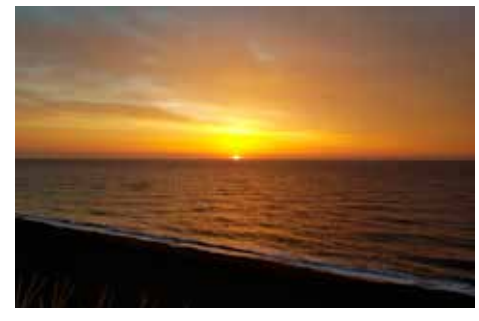
Photograph of the dawn of a new day taken by Peter on holiday in Suffolk